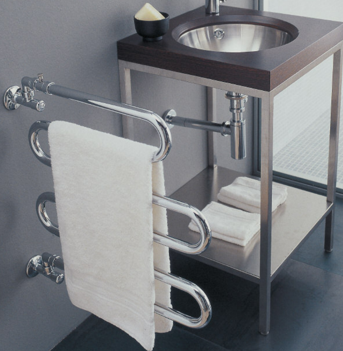
Chromium-plated radiator (cod. 50)