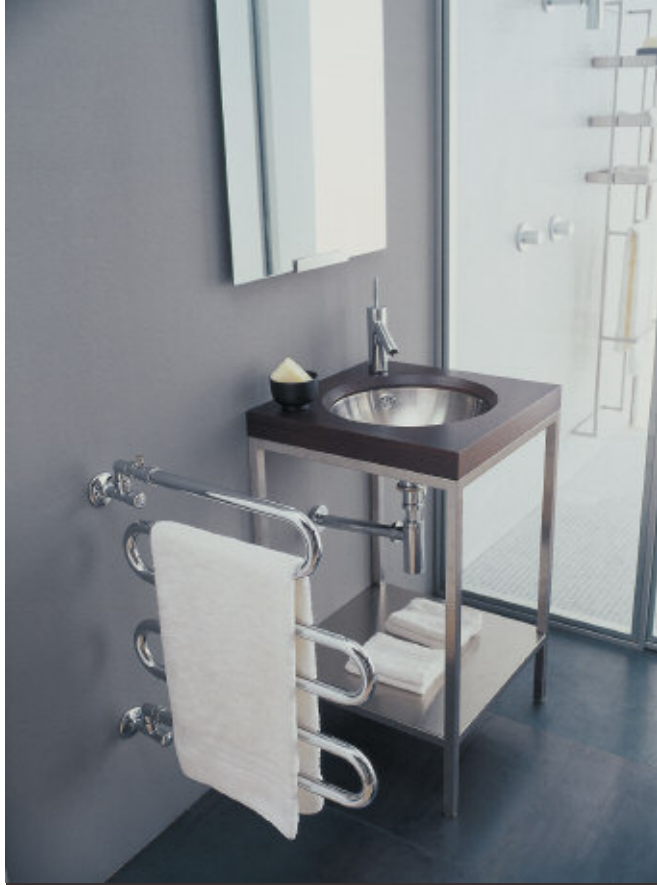
In photo: Alatherm radiator, model maxi colour Chrome plated (cod. 50).