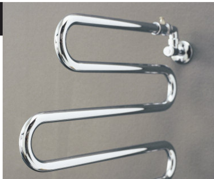
Chromium-plated radiator (cod. 50)

Size in mm: 450 x 325 h and 550 x 525 h.