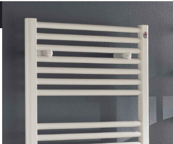
Ares Electric Chromium-plated is available also in Standard White version.

Chromium-plated ARES radiator is available in an electric-only version for those situations where it is not possible, or worth-while, to connect them to the normal heating system. They are supplied complete with wall fixing kit. Power supply 230 V / 1 ph / 50 Hz, class 1, IP 54.