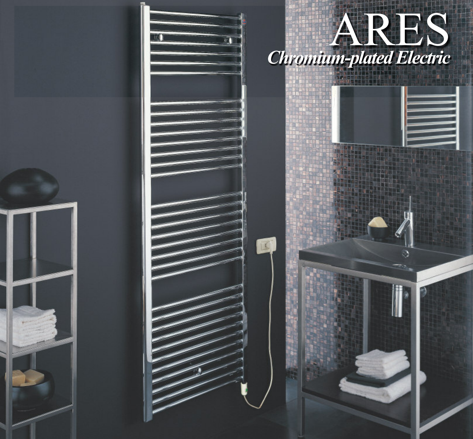
Chromium-plated radiator (cod. 50). Immersion heaters with electronic control.