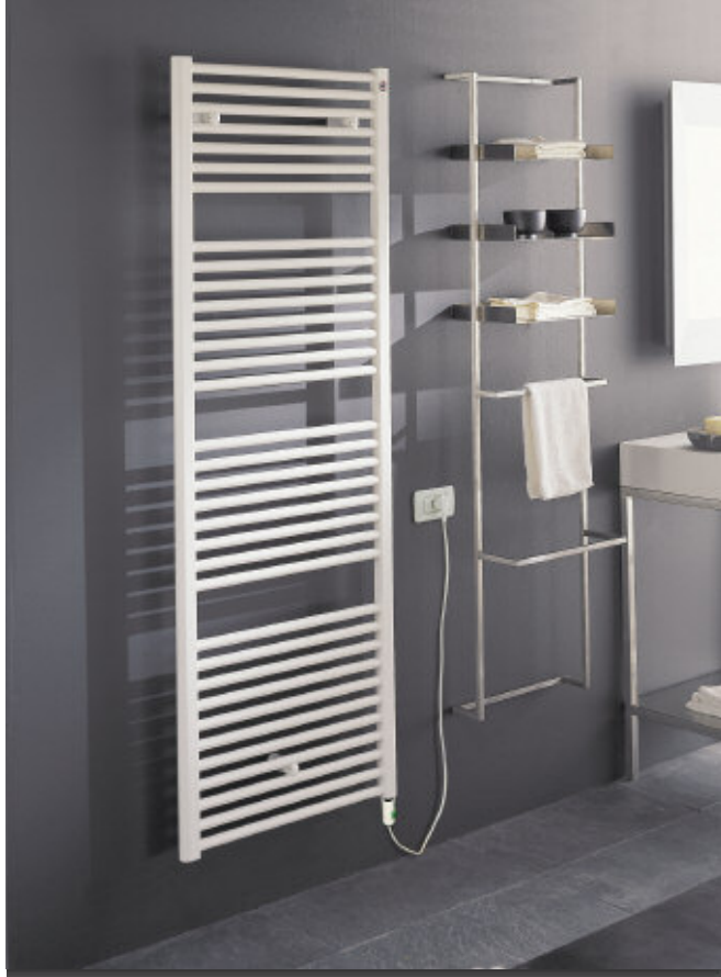
In photo: Ares Electric radiator. Height mm 1720, width mm 580, colour Standard White (cod. 01). Electric heater with switch.