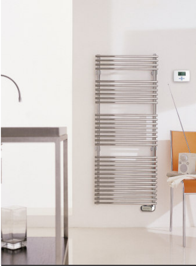
In photo: Flauto Chromium Electric radiator. Height mm 1762, width mm 506, colour Chrome Plated (cod. 50). Electric heater with controller Wireless.