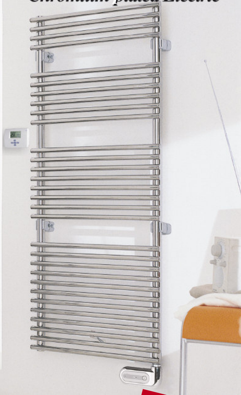
Chromium-plated radiator (cod. 50). Immersion heaters with wireless electronic control.