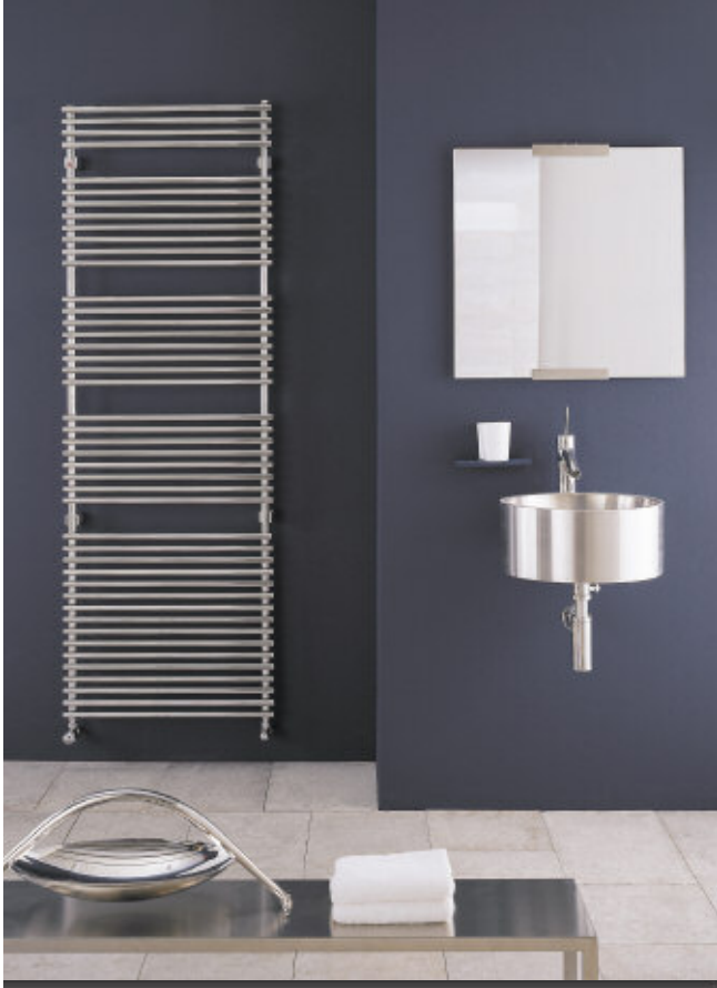
In photo: Flauto Chrome radiator. Height mm 1762, width 606 mm, colour Chrome plated (cod. 50).