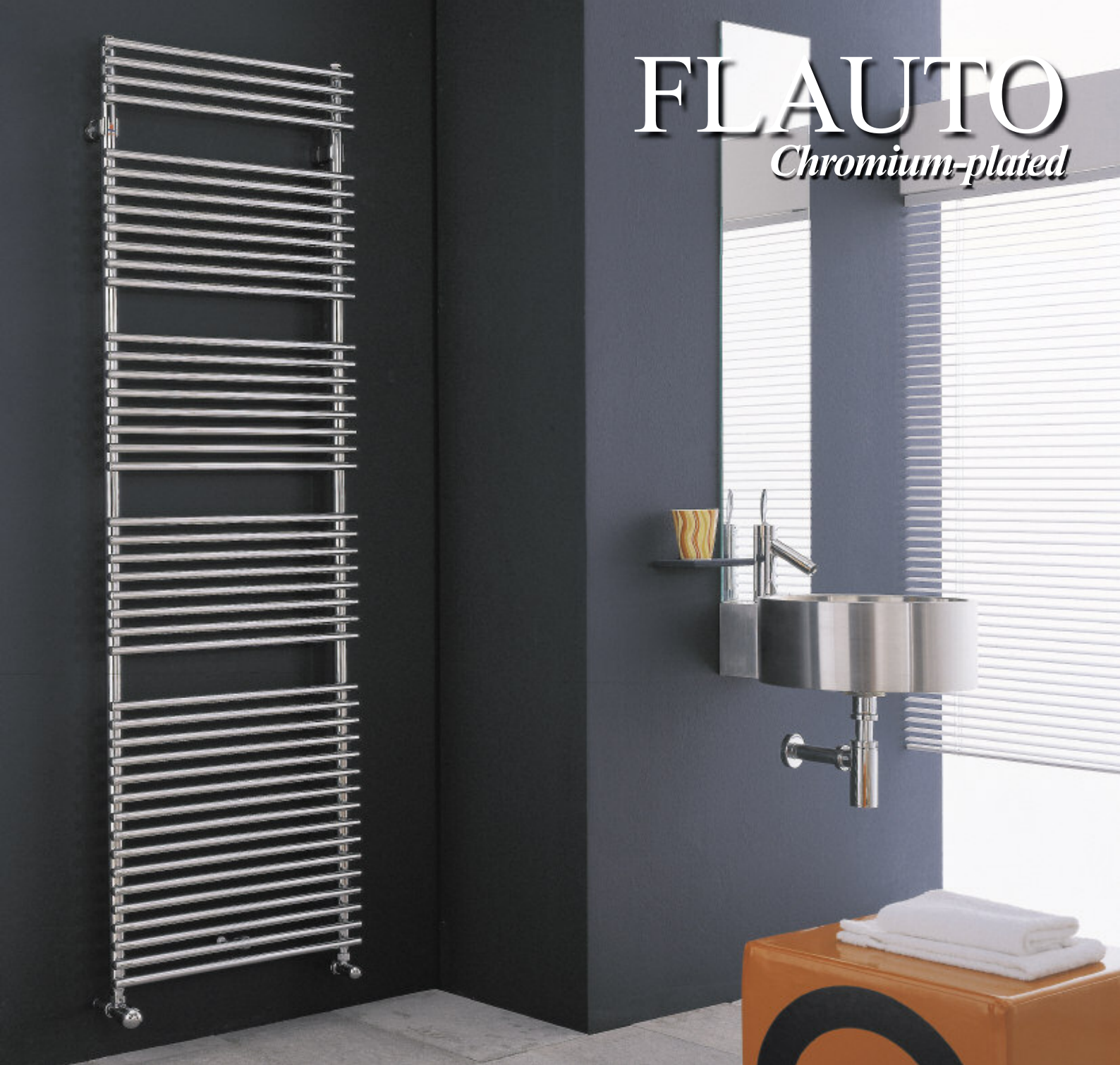
Chromium-plated radiator (cod. 50)