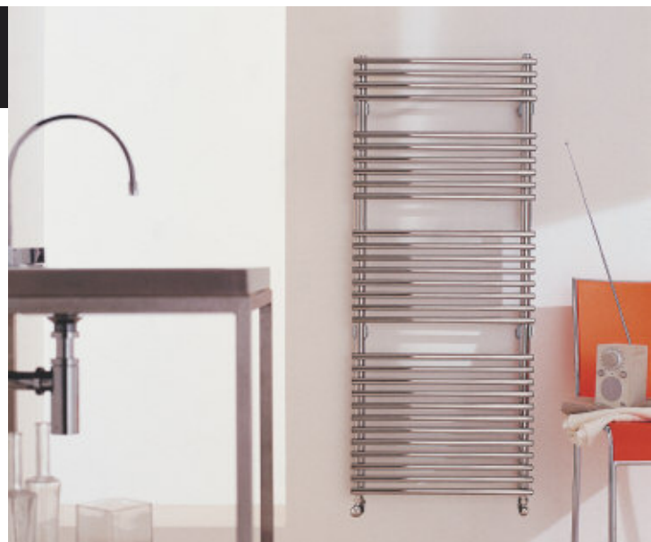
Chromium-plated radiator (cod. 50)

Innovative aesthetic criteria are emphasised in the chromium-plated version of the FLAUTO radiator. The charm of this version brings harmony to any bathroom environment and demonstrates how the choice of modern design and quality continues to evolve.