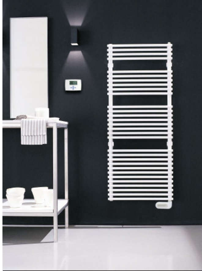
In photo: Flauto Electric radiator. Height mm 1762, width mm 506, colour Standard White (cod. 01). Electric heater with controller Wireless.