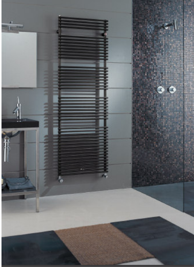
In photo: Flauto radiator. Height mm 1762, width mm 606, colour Satin Black (cod. 30).