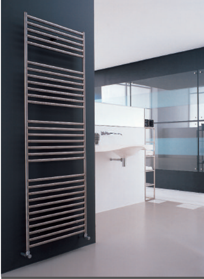
In photo: Stilé radiator. Height mm 1792, width mm 481, finish in Stain stainless steel (cod. AS).