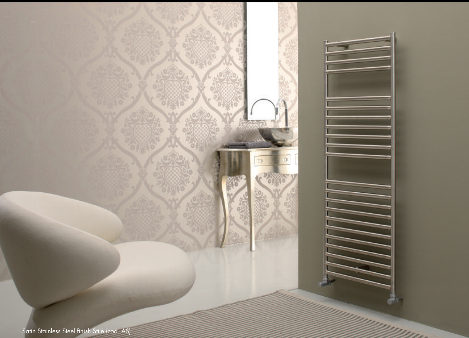
Satin Stainless Steel finish Stilé (cod. AS)