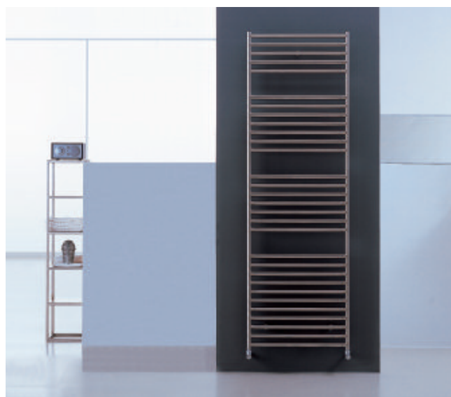
Satin Stainless Steel finish Stilé (cod. AS)

STILÉ has an essential line and makes a strong impact. The wealth and luminosity of the stainless steel determine a harmonious and special play of light and shadow. STILÉ is linear and elegant and its refined beauty integrates with style into any type of interior.