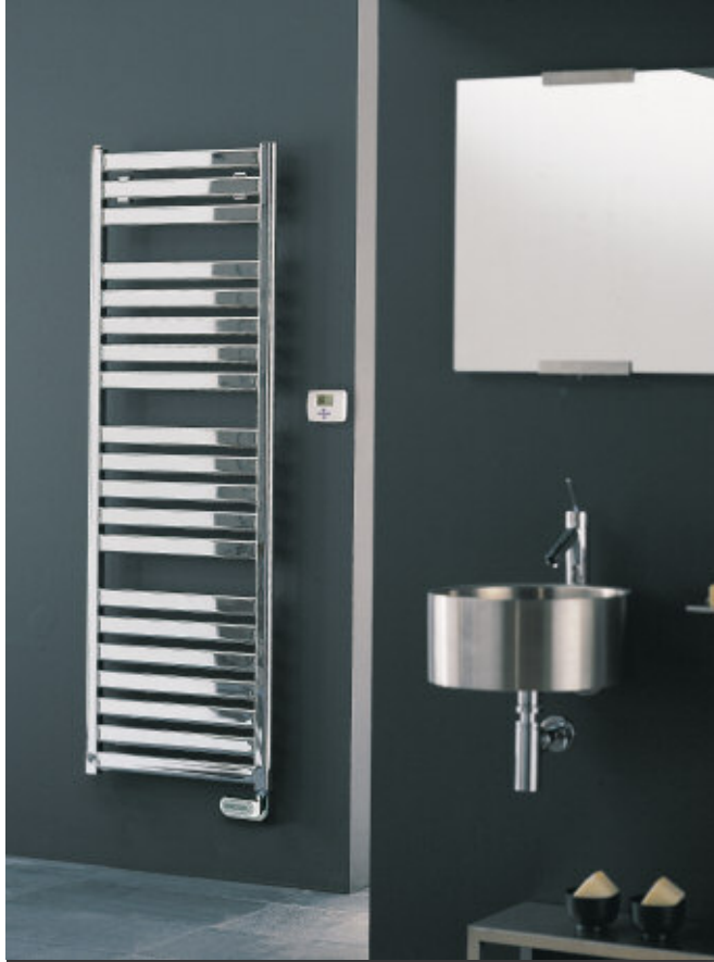
In photo: Vela Chromium Electric radiator. Height mm 1820, width mm 560, colour Chrome Plated (cod. 50). Electric heater with controller Wireless.