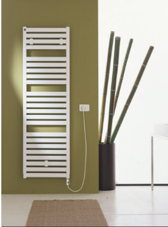
In photo: Vela Electric radiator. Height mm 1820, width mm 560, colour Standard White (cod. 01). Electric heater with controller Wireless.