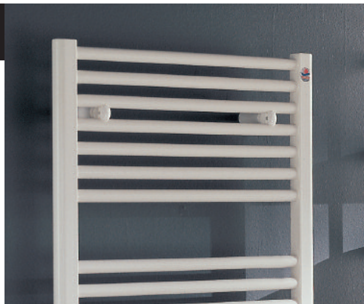
Venus Electric Chromium-plated is available also in Standard White version.

Chromium-plated VENUS radiator is also available in an electric-only version for those situations where it is not possible, or worth-while, to connect them to the normal heating system. They are supplied complete with wall fixing kit. Power supply 230 V / 1 ph / 50 Hz, class 1, IP 54.