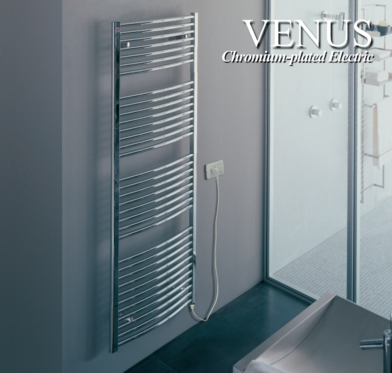
Chromium-plated radiator (cod. 50). Immersion heaters with electronic control.