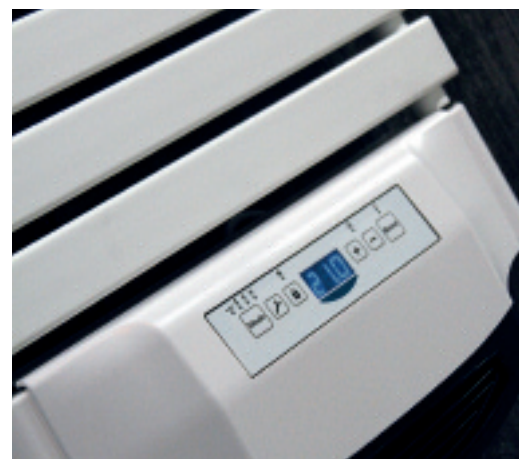
Photo: detail of the air diffuser and remote controls, Standard White colour (code 01). Coloured radiators feature a chromium-plated air diffuser.

Thanks to the infrared remote control (supplied as standard), it is possible to remotely adjust the desired temperature and the hot air diffuser.