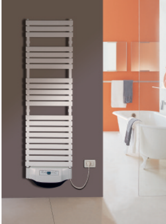
In photo: Xilo Aliseo electric radiator. Height mm 1584, width mm 506. Colour Standard White (cod. 01) - electric heater.