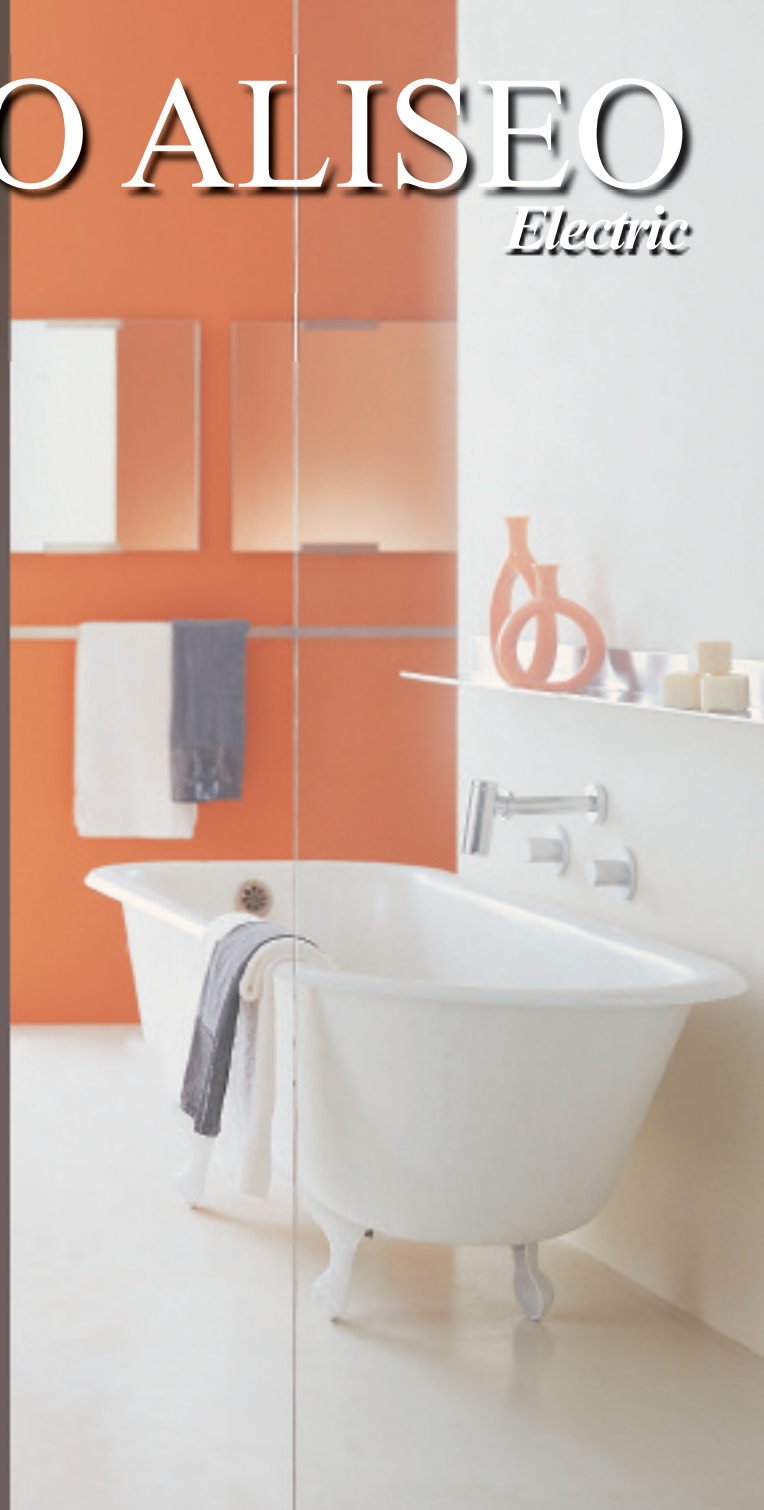
Electric radiator painted in Standard White (cod. 01).