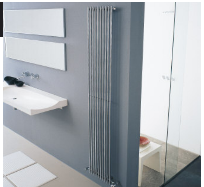
Chromium-plated radiator (cod. 50)

Available in heights ranging from 520 to 920 mm and lengths from 4 to 40 sections in even numbers and in heights ranging from 1520 to 2520 mm and lengths from 4 to 28 sections in even numbers.