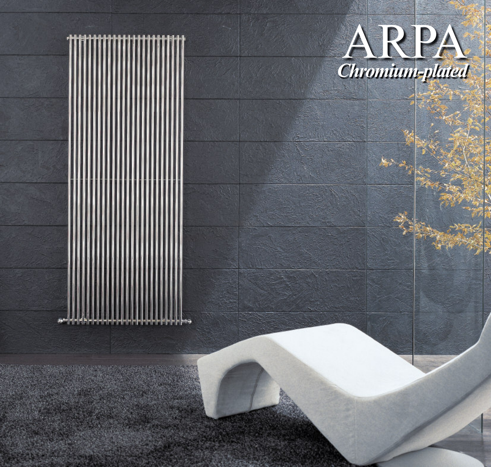
Chromium-plated radiator (cod. 50)