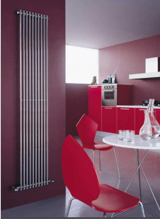
In photo: Arpa Chrome plated radiator. Height mm 2020, 10 elements, colour Chromium (cod. 50).